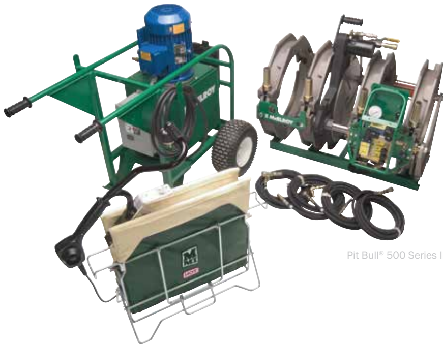
Pit Bull® 500 Series II

Fusion Capability for 315mm – 500mm (12"-20") Polypropylene Pipe