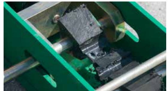
Destructively tested coupon