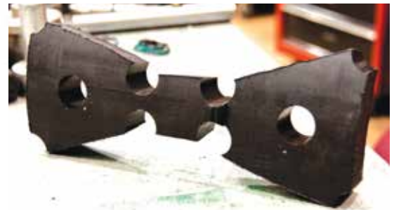
Example of dual-reduced section testing coupon

Specifications subject to change without notice.