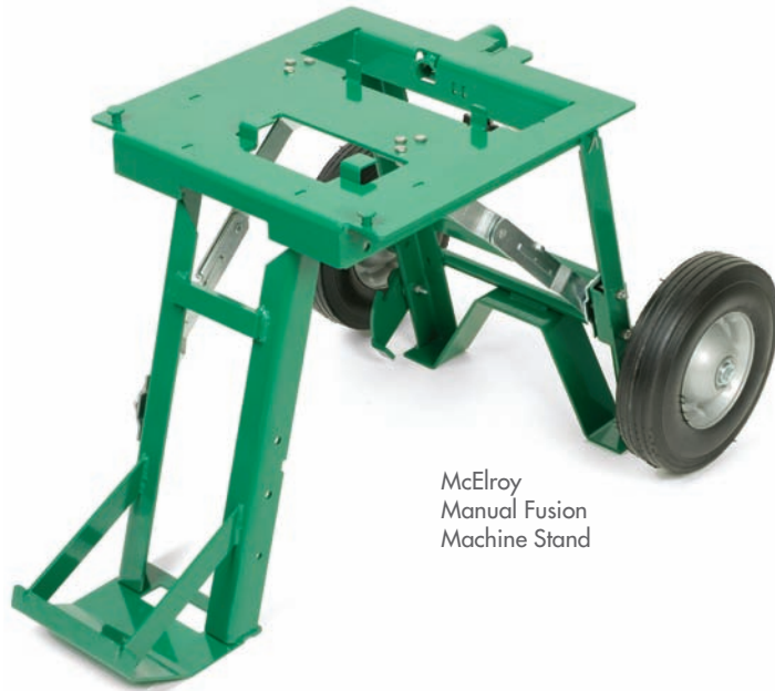
McElroy Manual Fusion Machine Stand

Productivity Aid for 2LC, Pit Bull® 14 and Pit Bull® 26 Fusion Machines