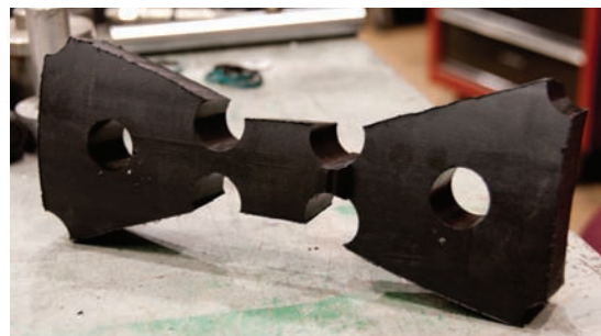
Example of dual-reduced section testing coupon

Specifications subject to change without notice.