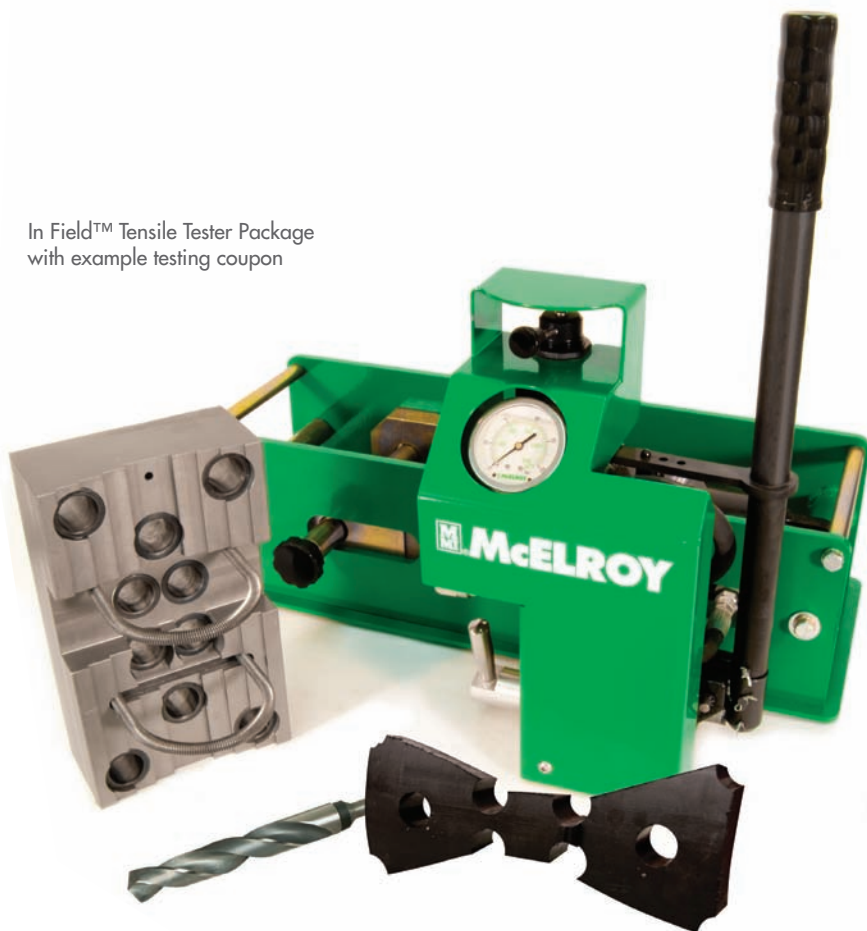
In Field™ Tensile Tester Package with example testing coupon

Field Tester for 2" IPS and larger pipes