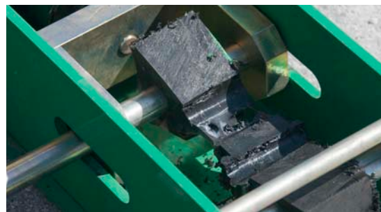
Destructively tested coupon