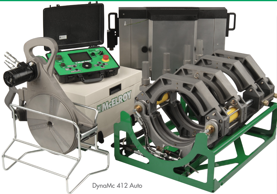
DynaMc 412 Auto

Fusion Capability for 110mm — 340mm (4" IPS — 12" DIPS)