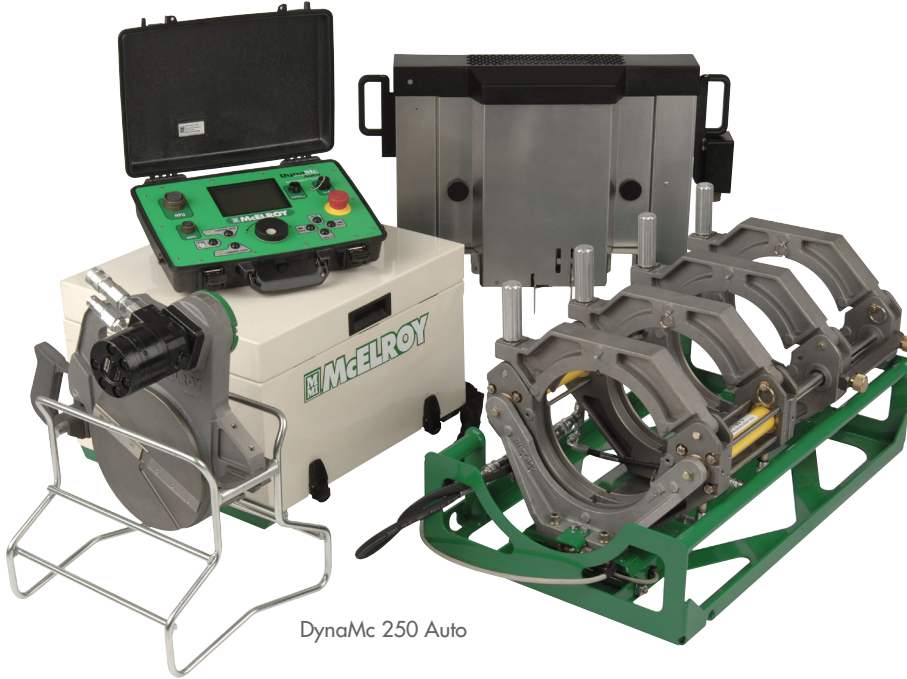
DynaMc 250 Auto

Fusion Capability for 63mm — 250mm (2" IPS — 8" DIPS)