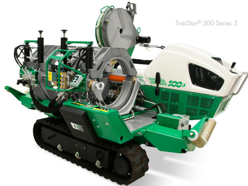
TracStar® 500 Series 3

Fusion Capability for 6" IPS to 20" OD (180mm - 500mm)