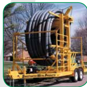
Example of Coiled Pipe Trailer

Proper handling of coiled pipe, conduit or duct requires the McElroy LineTamer to be mounted on a specially designed, heavy-duty, coil pipe trailer. McElroy has worked closely with several OEM trailer manufacturers to provide complete trailer packages featuring the LineTamer. Each trailer has been engineered to handle the coil and correctly align the pipe to optimize re-rounding and straightening. Custom configurations, such as coil self-loading, powered threading rollers and other customer-specific features are available. Contact your McElroy representative about a LineTamer trailer package to meet your pipe-handling needs.